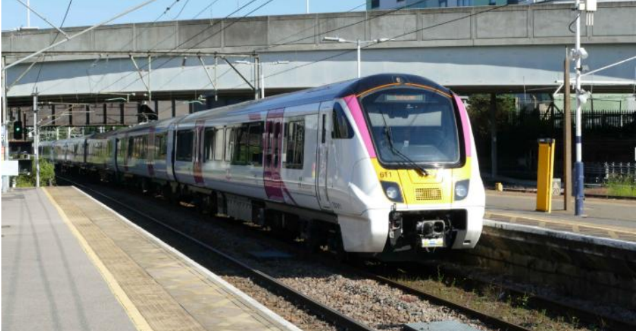
Penultimate 720/6 unit 720611 at Barking on 7 June 2024. Ken Aveyard

Friday morning and we caught the 0641 shuttle service from Romford to Upminster and on to c2c to Barking for the morning peak period. Our targets were as many of the c2c class 720/6 units as were in service, plus our final 710, 710270 which is a regular on the Goblin service. Although the booked diagrams were for four pairs of 720/6 in service, a fifth pair turned up and we copped 7 in total bringing our future wants down to 2 units. We were also able to clear 710270 on the Goblin service.