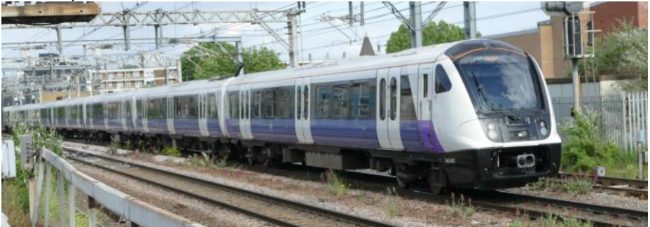
345042 passes Bethnal Green on one of the Liverpool Street to Gidea Park peak hour short workings on 5 June 2024. Ken Aveyard

Changing from the Central Line at Liverpool Street we headed for the Elizabeth Line platforms, and sure enough 345056 and 345064 were duly copped. A quick trip outside the station for supplies from Tesco and some bus photographs then we headed back in to Liverpool Street and a train out to Bethnal Green for the evening peak. We needed to see the 1530 Cambridge departure as it wasn't due back until 1845 but otherwise it was a case of how many class 720's we could cop. One surprise was Network Rail 153376 which crept out on a route survey, but otherwise there was the usual mix of 710 720 and 745 units plus the triple 755 set on the Norwich service. As Anglia are now on Real Time Trains we were able to look up the units we needed and managed to cop 9 before there were no more on the horizon. We did find one working between Stratford and Bishop's Stortford so we hopped on a 710 in to Liverpool Street and 720568 out to Stratford. At Stratford 720501 was duly copped and with nothing else coming up on Real Time Trains we boarded an Elizabeth Line train to Romford for the Travelodge and a meal in Wetherspoons.