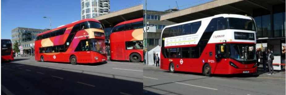
East London Buses LT928 and Arriva EH43 liveried up for the SL2 Superloop service from Walthamstow to North Woolwich Ferry. KA

Having seen all the expected workings, we exited the station in search of breakfast with plenty of time to photograph buses before the 0930 start time for the day's travelcard. Barking is the place to see the East London liveried Borismasters, plus many other standard London buses, including one of the new Superloop services. The surrounding buildings make photography difficult on a sunny day.