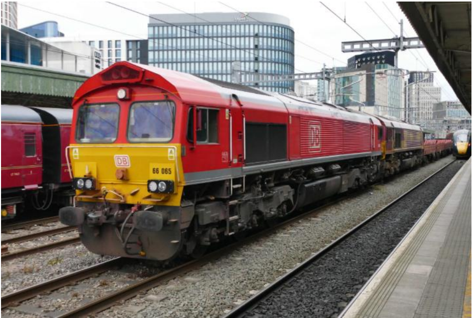
66065 leads 66092 through Cardiff station on 3 May 2024.