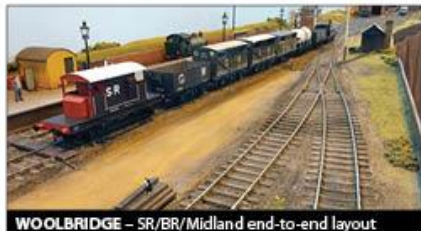
WOOLBRIDGE – SR/BR/Midland end-to-end layout