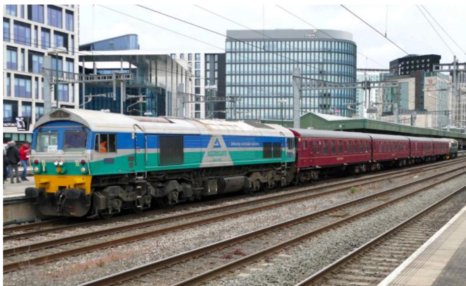
59103 with D6515 and the London Transport 4TC set at Cardiff.