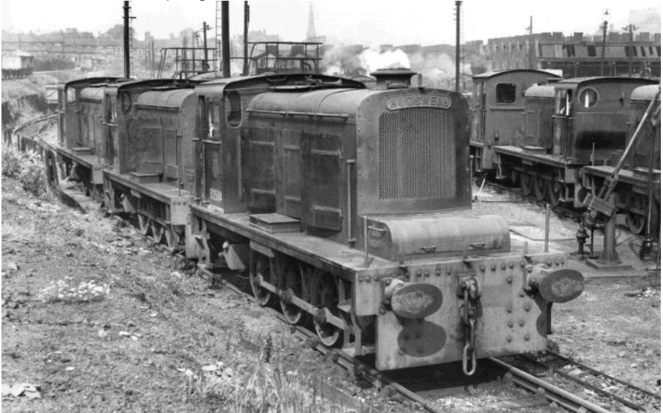
D2504 and various Hudswells at Birkenhead 30 08 1959

This small class was designed to replace steam shunters on Birkenhead Docks and were delivered in late 1955/1956 to Birkenhead shed where they spent all their short lives before being withdrawn in 1967 – victims of standardization and changing freight patterns. The builder's plate is a handsome brass oval that was fitted to the transmission cover at the front of the bonnet. This particular locomotive was cut up at Booth's yard in Rotherham in the Spring of 1968.