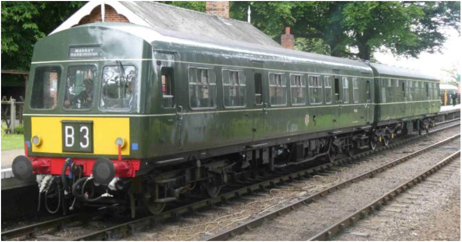
1960 built Metro-Cammell class 101 DMBS M51188 running coupled to Birmingham RCW DTC M56182.