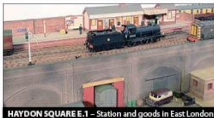
HAYDON SQUARE E.1 – Station and goods in East London