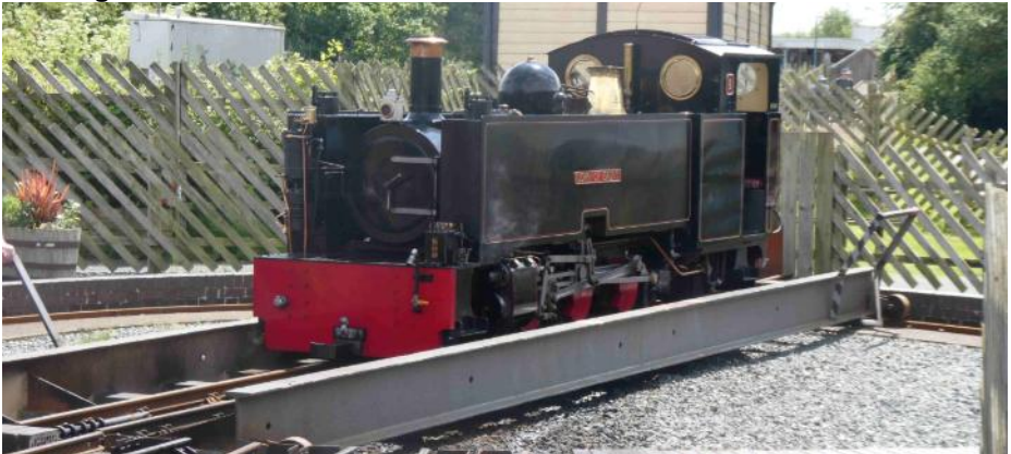
BVR 8 John O Gaunt a Rheidol look alike 2-6-2T. 20 June 2024.