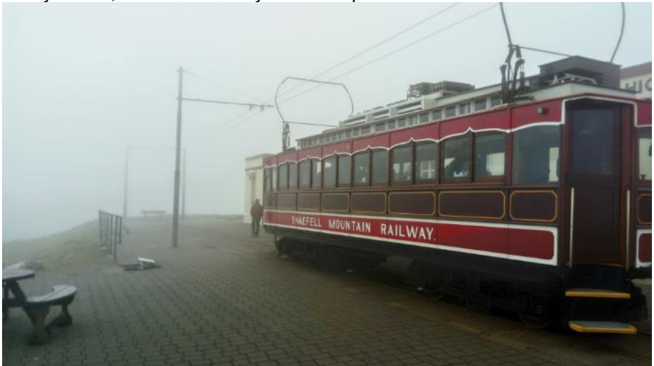
The view (!) at the top of Snaefell.

On Monday, I joined the coach party for the trip up the Snaefell Mountain Railway and to the Laxey Wheel, or Lady Isabella as she is known. Down at Laxey in the morning, the sun was out, but as we started to climb up Snaefell and passed the half way point at The Bungalow, the mist and cloud set in and by the time we got to the top, we couldn't see a thing! Some of us ventured up to the summit, where we had a bit of a job to stand upright, before re-joining the majority of the tour participants in the café. Typically, as we descended, the sun broke through again and later in the day, whilst back down at the Laxey Wheel, we could actually see the top of Snaefell.