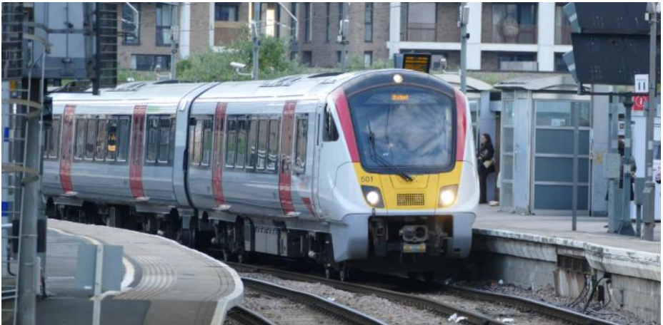
720501 the unit we stopped off at Stratford to cop. Ken Aveyard