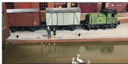
SHAFTESBURY STREET YARD – London docks diorama