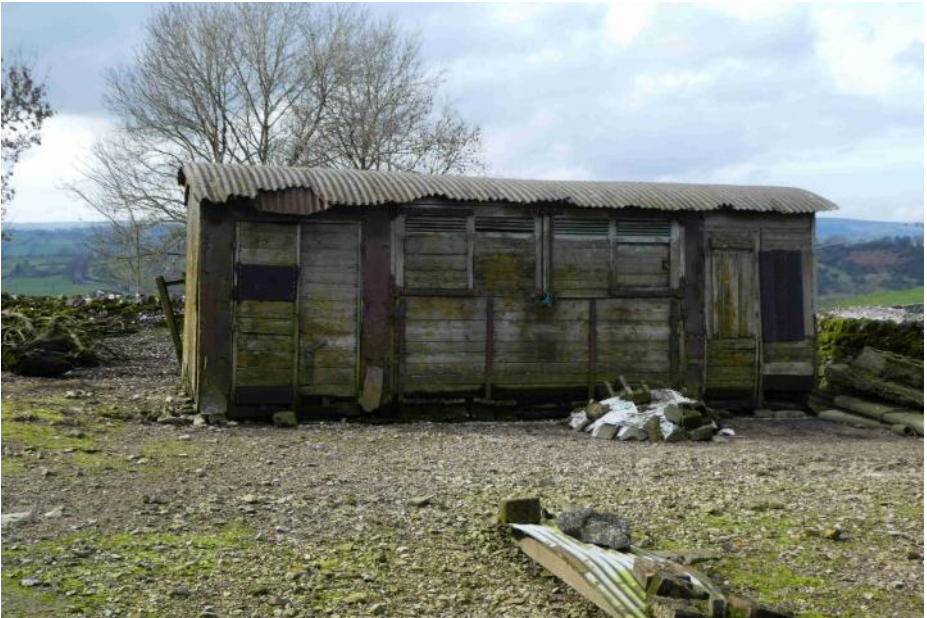
This grounded body is LMS 4535, later renumbered 42015, a 1926 built four wheel horse box, to diagram D1878. It is seen near Hartington in the Peak District on 25 February 2024. Information courtesy of Rail Heritage Register On-Line.