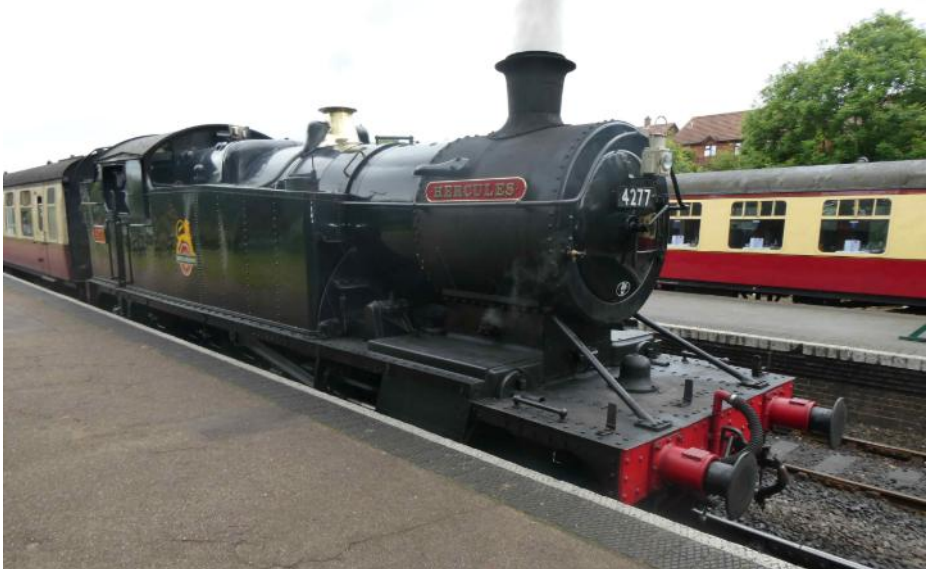
Ex GWR 2-8-0 T 4277 Hercules on loan from Paignton on 15 June 2024.