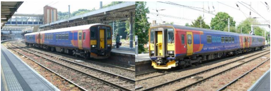
153384 leads 153379 through Ipswich on 6 June 2024. Ken Aveyard

From Chelmsford it was 745006 that took us to Ipswich arriving at 0806. At Stowmarket we had passed Network Rail 153379 and 153384 and they worked through Ipswich at 0941.