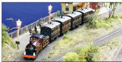
GREYTON & WENLOCK RAILWAY – 7mm narrow gauge