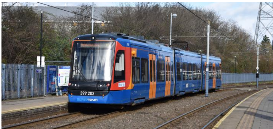
Arena Don Valley Stadium Tram-Train 399202 heading for Parkgate on 26 February 2024.