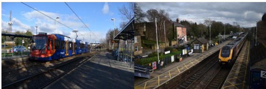
Attercliffe tram 115 for Meadowhall and Dronfield 221122 1S45 09.27 Plymouth - Glasgow Central 25 February 2024