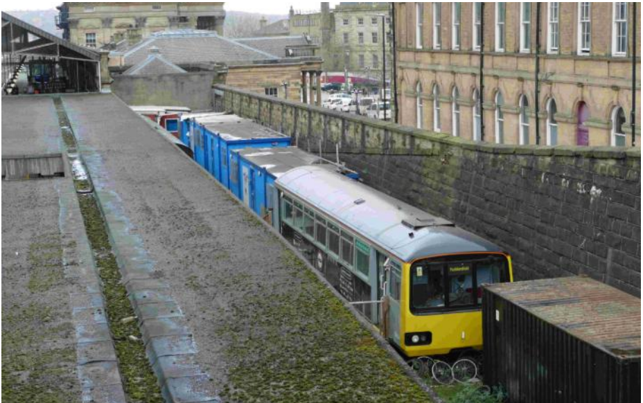
Huddersfield station has a mental health charity on site. A recent arrival is driving car 55824 from Northern Rail class 144, 144001 which previously carried the Penistone Line Partnership name and would have departed from the adjacent platform on many occasions. Picture taken on 19 February 2024.