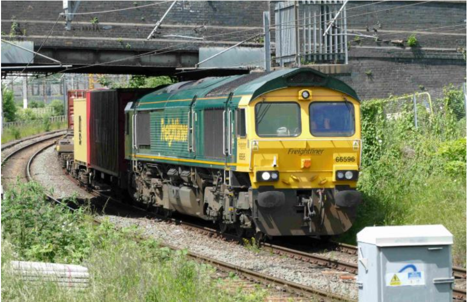
66596 heads from Wembley Yard towards the North London Line at Willesden Junction Low Level on 5 June 2024.