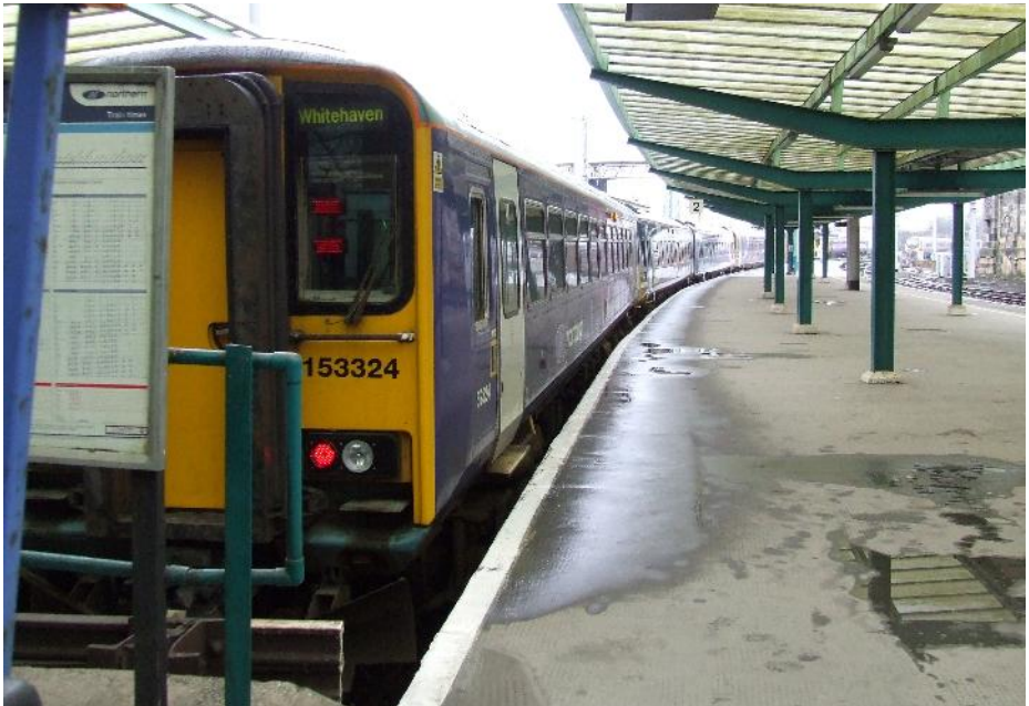
153324 158797 153301 in the Workington bay at Carlisle 30 March 2011