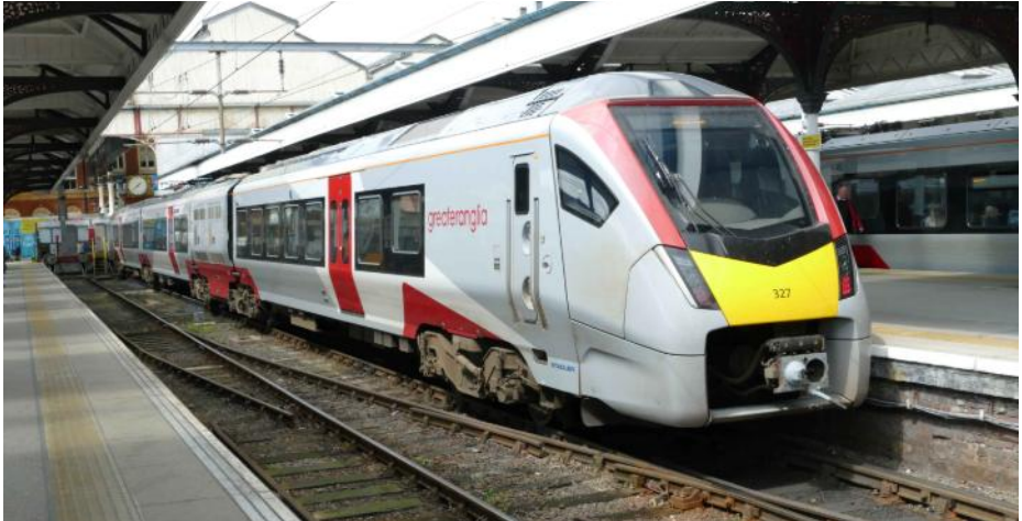
755327 sits in Norwich station on 6 July 2024.

I had walked all the way to the bus station when at 1245 Colin phoned me to say he had been looking at all the three coach arrivals at Norwich on Real Time Trains and 755327 was in fact in service and would be arriving back in Norwich at around 1330. With that news I set off on the walk back and arrived at Norwich Station just as 755327 pulled in.