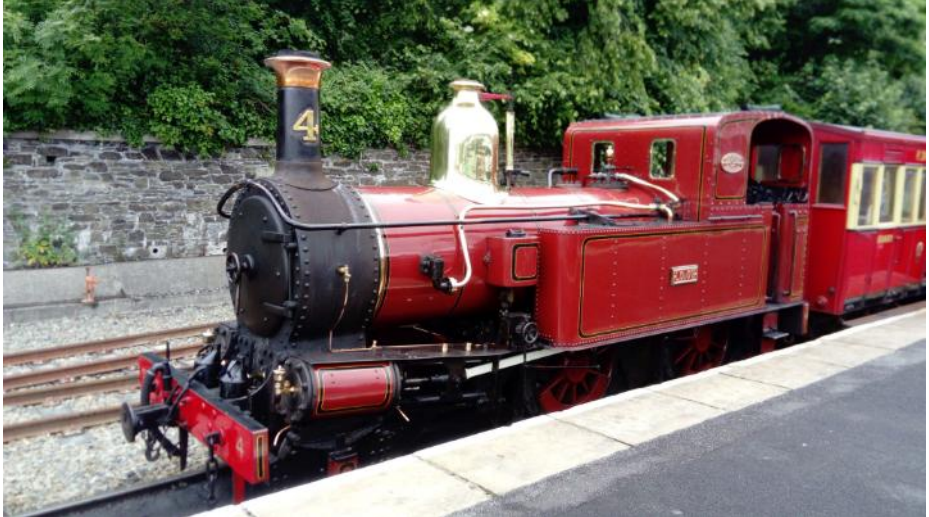
No.4 'LOCH' ready for departure at Douglas.

The only real bit of rain I experienced was on Saturday morning, so unfortunately, I got wet walking between the museum and Douglas station, as I made my way to catch the first of my trips. This was behind No.13 'MAITLAND' on a four-coach set down to Castletown where I changed trains and headed back to Douglas on board a five-coach set headed by No.4 'LOCH'. After a spot of lunch, I then travelled behind 'LOCH' all the way to Port Erin where I met up with the coach party for the single journey to Douglas.