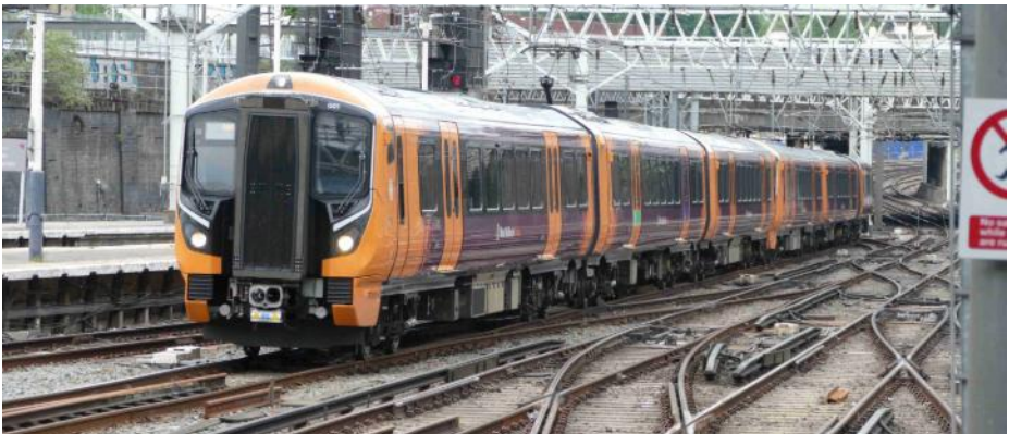
730001 and 730048 in West Midlands Trains livery working for London North Western arriving at Euston on 7 June 2024. Ken Aveyard

After seeing the 701's we returned to the Overground heading back to Willesden Junction where we went up on the big footbridge to watch the 1503 from Euston to Chester pass, which according to Real Time Trains had 805010 and 805009 on, the latter being a cop. We then went down to the low level and caught a DC line service in to Euston where we remained on the platform for the evening peak. Although the DC line platforms are short, you don't get obstructed by longer trains on adjacent platforms as they tend to be the London Midland 8 car sets whilst the longer Avanti trains are at the outermost platforms.