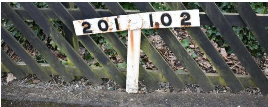
Palindromic gradient post at Dronfield 25 February 2024.