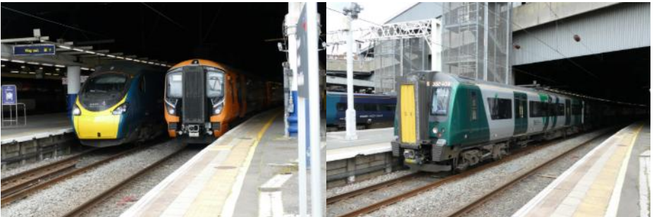
390045 and 730002 show how the outer platforms extend further in to the concourse so a 9 car Pendolino lines up with a 6 car 730. Former Trans Pennine 350408. These units will remain when the 350/2 series are replaced by the 730/2 units later in 2024. Ken Aveyard

The final service from Chester due in at 1835, which would have been plain white liveried 805002, didn't leave us enough time to get to our respective trains home, so Colin headed off for Kings Cross, whilst I used the tube to get to Waterloo for the 1905 back to Branksome. My advance was for the 1905 service arriving at Branksome at 2103 not the 1905 service arriving at 2119 which meant I had to sit in the front unit of the train, which was good because it was 444027 with 450080 on the rear. Arrival at Branksome was pretty much on time and the three days away had yielded a total of 49 emu cops but no locomotives. Next year hopefully it will be 49 701's but don't hold your breath!