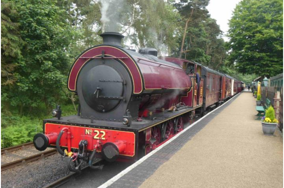
Hunslet Austerity 22 of 1956 is an ex National Coal Board locomotive withdrawn in 1978 and owned by the Appleby Frodingham RPS