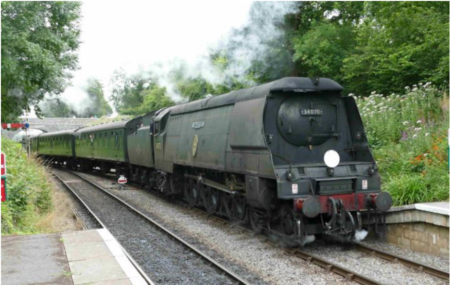
34070 Manston still carrying its grimy end of steam look from the Bullied gala arrives at Harmans Cross on 10 March 2024.