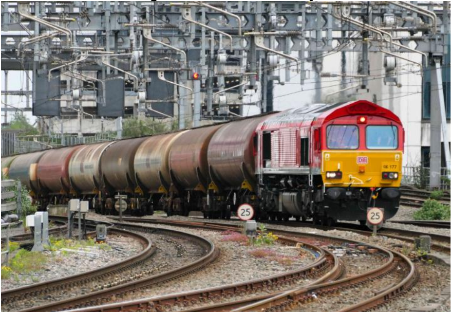
A lovely telephoto shot of 66177 climbing up to Cardiff station on the Theale to Robeston tanks on 3 May 2024.