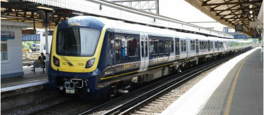
701039 on test through Clapham Junction on 7 June 2024.

We had a look from the overbridge at Clapham Junction finding 701028 701017 701031 701044 and 701528 in the sidings. After a diversion via Sainsbury's to pick up lunch, we returned to the suburban platforms where 59205 passed through on stone hoppers, and 378205 was seen carrying a colourful commemorative livery. We were also fortunate in seeing 701039 on test and 701043 on the solitary working diagram.