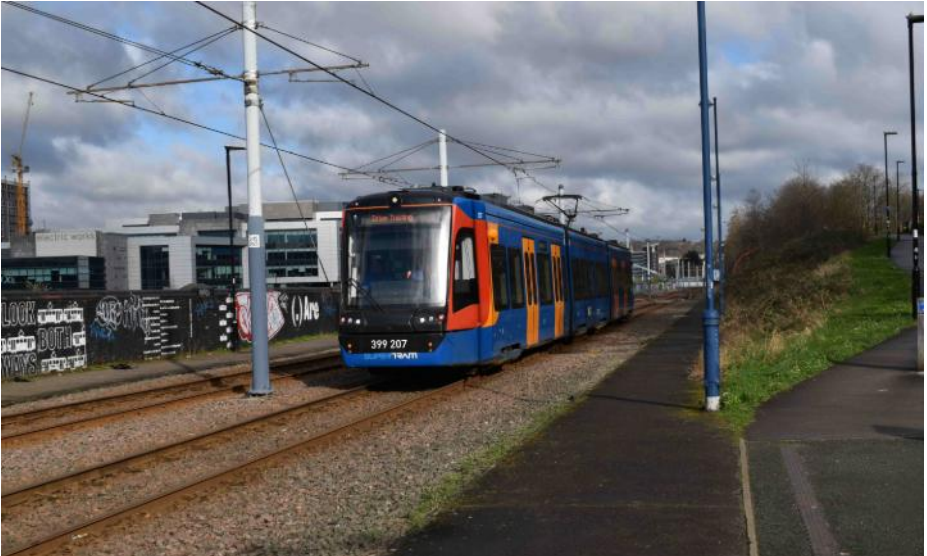
Sheffield Station - Sheffield Hallam University with Tram-Train 399207 undertaking driver training 26 February 2024.