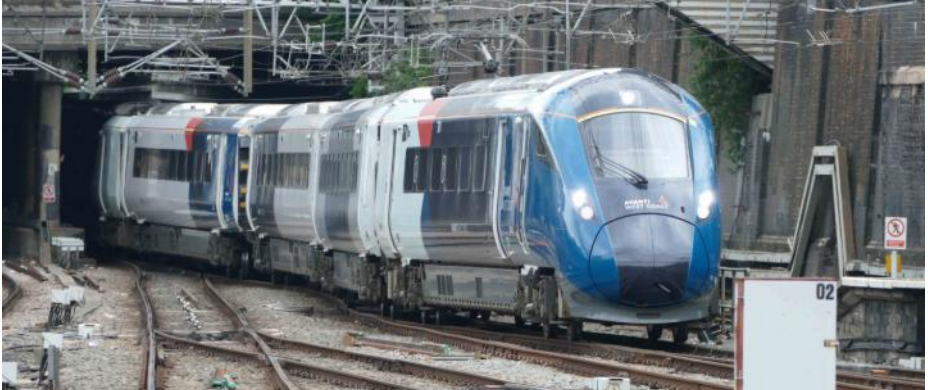
805001 heads a service from North Wales and Chester in to Euston with 805003 hidden in the tunnel behind on 7 June 2024. Ken Aveyard

We were principally looking for the Avanti 805 units plus any additional LNW units and 730001 730048 were seen paired up plus 730016 was seen attached to 730013 seen previously at Camden and 730010 working with 730002. The class 805's were expected in on the Chester and North Wales services at 1637 and 1735 and they brought 805005 805001 805003 and 805011 two of which were cops.