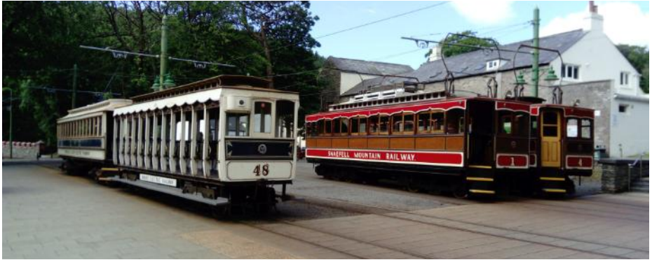
MER and Snaefell trams at Laxey. See article from page 20.