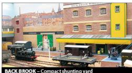
BACK BROOK – Compact shunting yard