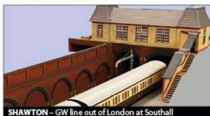
SHAWTON – GW line out of London at Southall