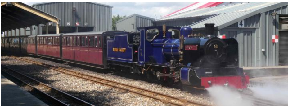
BVR 6 Blickling Hall a 2-6-2 inspired by the Indian Railways ZB class.