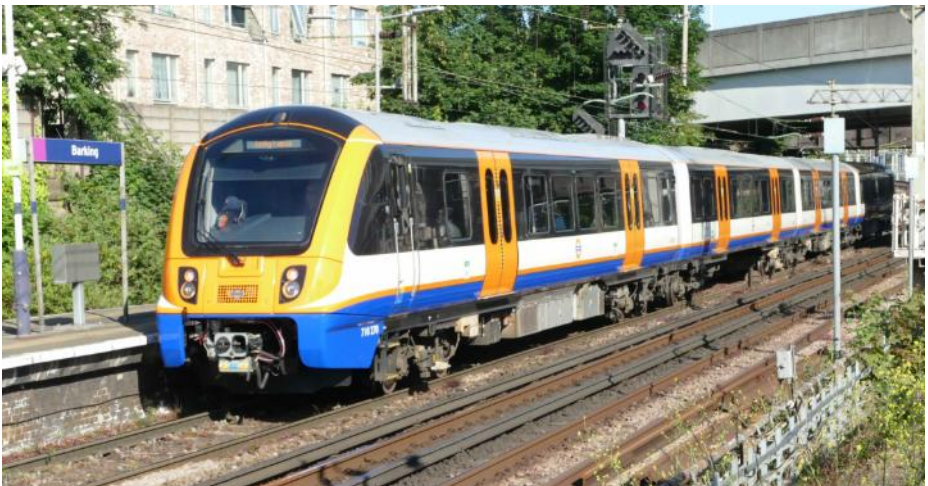
Class 710 unit 710270 heading for Barking Riverside on 7 June 2024 KA