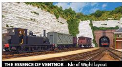
THE ESSENCE OF VENTNOR – Isle of Wight layout