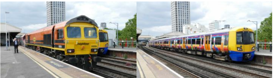
59205 passing Clapham Junction on stone hoppers and 378205 carrying a special livery on an Overground service to Stratford. Ken Aveyard

The itinerary for Friday had been left quite flexible in case we were still chasing the last two 345's but having cleared them we had a couple of targets in mind plus finally ending up at Euston for the evening peak. We boarded a c2c class 357 towards Fenchurch Street but passing the rear of East Ham depot a fair few 720/6 units were seen in the sidings so a quick change at West Ham and a District line service back to Barking sadly revealed them to be three of the sets seen earlier. So back again on c2c in to Fenchurch Street followed by a short walk to Aldgate for the Underground to Liverpool Street then on to the Elizabeth Line through to West Ealing. Passing Acton Yard we saw 66025 66158 66114 and on arrival at West Ealing we were delighted to find ex Vivarail battery electric unit 230001 in the bay platform waiting to depart on a test run. See picture on the front cover. We watched it depart and immediately hopped back on an Elizabeth Line service to Ealing Broadway where we changed to the Central Line to Shepherd's Bush and on to the Overground to Clapham Junction.