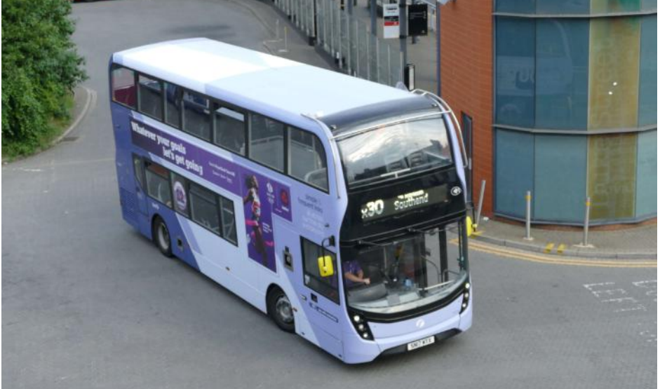
First Eastern England 34424 SN17MTX new as Yellow Buses 103 one of a number of Enviro 400mmc models that were returned to their leasing company when Yellow Buses closed. Chelmsford Bus Station viewed from the railway on 6 June 2024. Ken Aveyard

Thursday morning and we're up early to catch 345011 on the 0621 from Romford changing at Shenfield on to 720134 to Chelmsford. The time at Chelmsford was spent photographing buses from the platform.