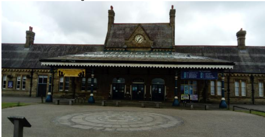
The rather splendid looking former Morecambe station frontage. Sgreen

Heathside Travel were the organisers of that trip, and when I saw their holiday brochure for this year, I thought it might be a good idea to book myself on it to tick off the SMR amongst other attractions. None of the previous WRS or MVR tour participants were booked on the trip, so it meant I could do my own thing, but join the party for the Snaefell trip. This June 2024 trip followed the same route up and back, so the coach journey on the first day included a lunch stop at Trentham Gardens followed by an overnight stop near Preston. The next day saw us head to Morecambe for about 1 ½ hours, which allowed me to photo the old station and hotel opposite, plus the new/replacement station, which I didn't bother photographing as it was pretty uninspiring! (I expect Paul Carpenter has a photo if you are desperate!) We then made our way over to Heysham to catch the ferry over to the City of Douglas and our hotel for the next few nights.