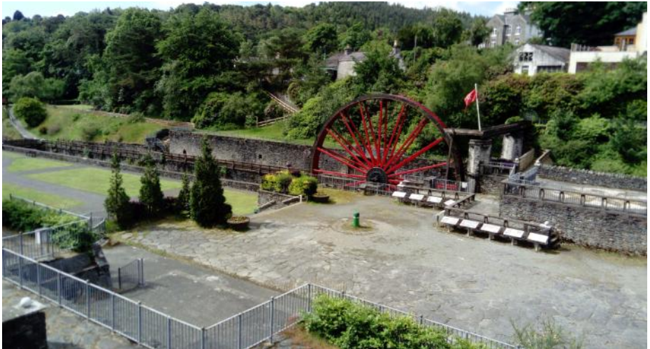
The washing floor of the Laxey Mines.