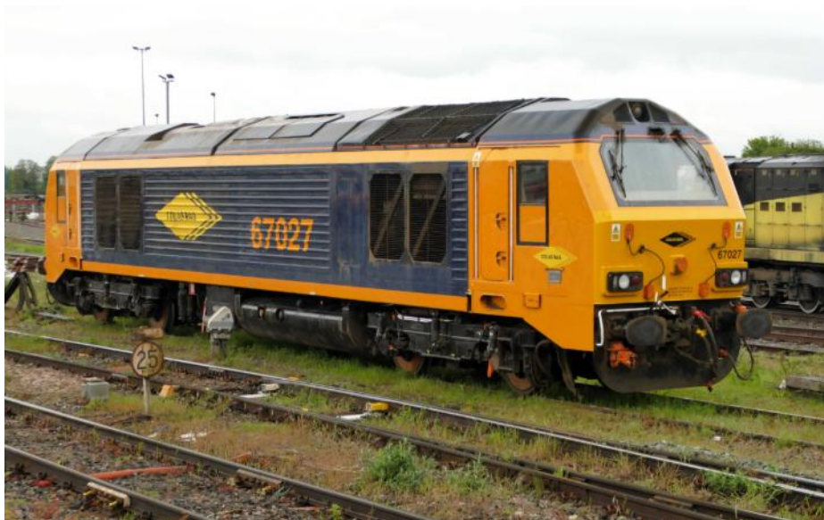
GBRf livery but Colas operated. 67027 is seen at Westbury Station before catching the train to Cardiff on 3 May 2024.