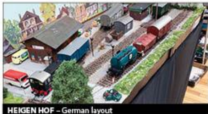
HEIGEN HOF – German layout