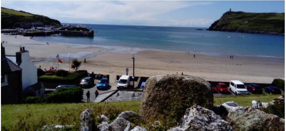
A view of Port Erin harbour.