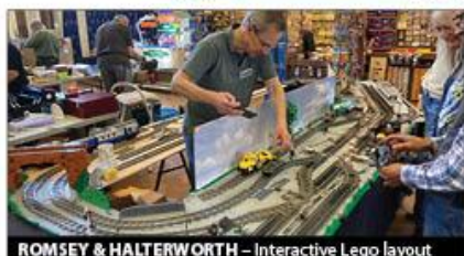
ROMSEY & HALTERWORTH – Interactive Lego layout