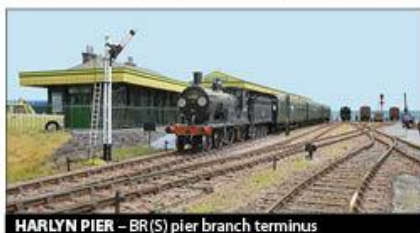
HARLYN PIER – BR(S) pier branch terminus