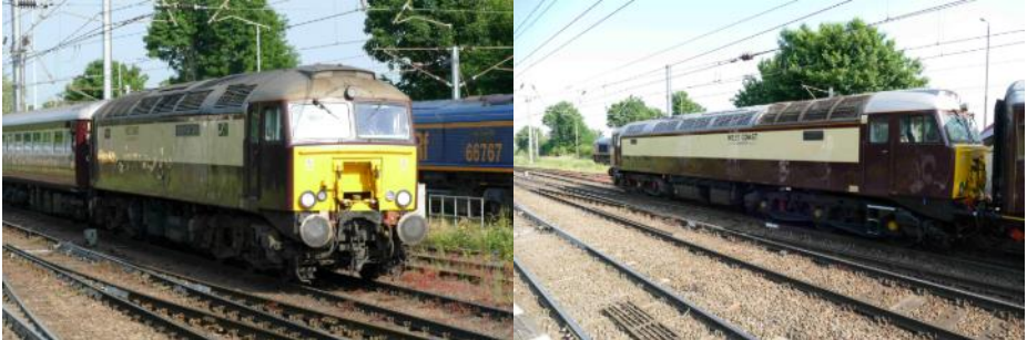
57313 and 57315 at Ipswich on 6 June 2024.

Before that however we found a special from Norwich due to reverse in Ipswich and head towards Peterborough, en route to Chesterfield, which we surmised would be for coaches to Chatsworth House. This turned up as 57313 and 57315 on a rake of Pullman liveried Mk2 coaches.