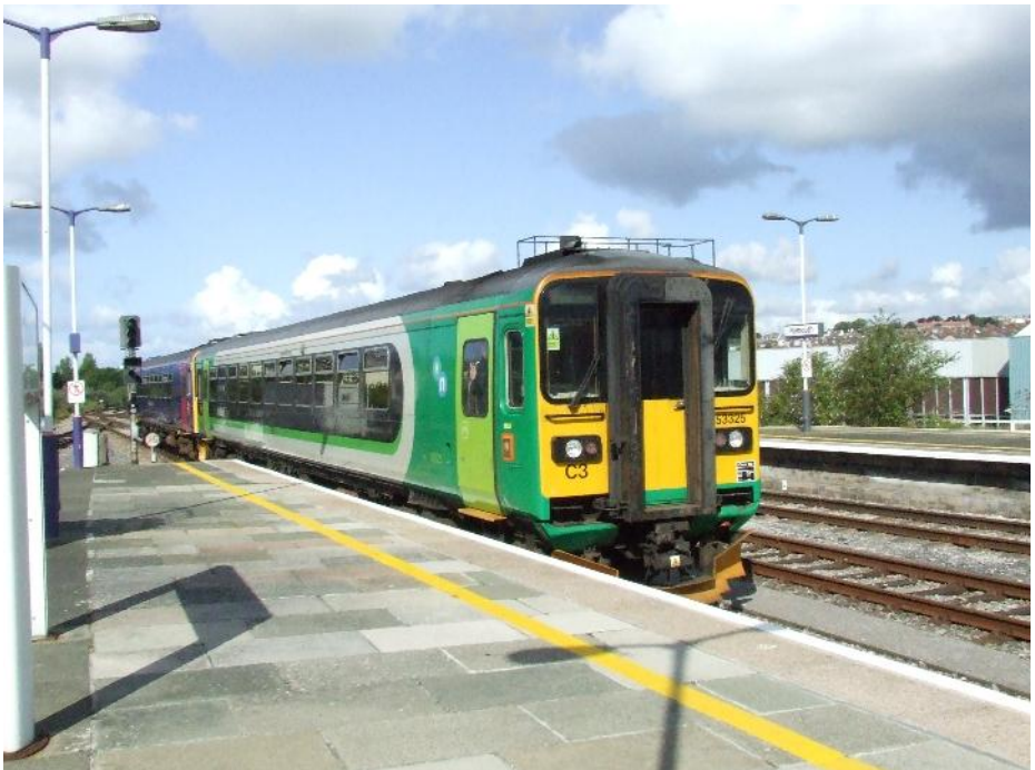
Ex Central trains 153325 and GWR 153318 in Plymouth 29 June 2011. KA